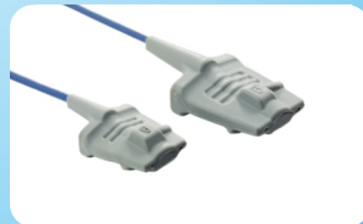
Adult/Pediatric Soft-Finger Sensor